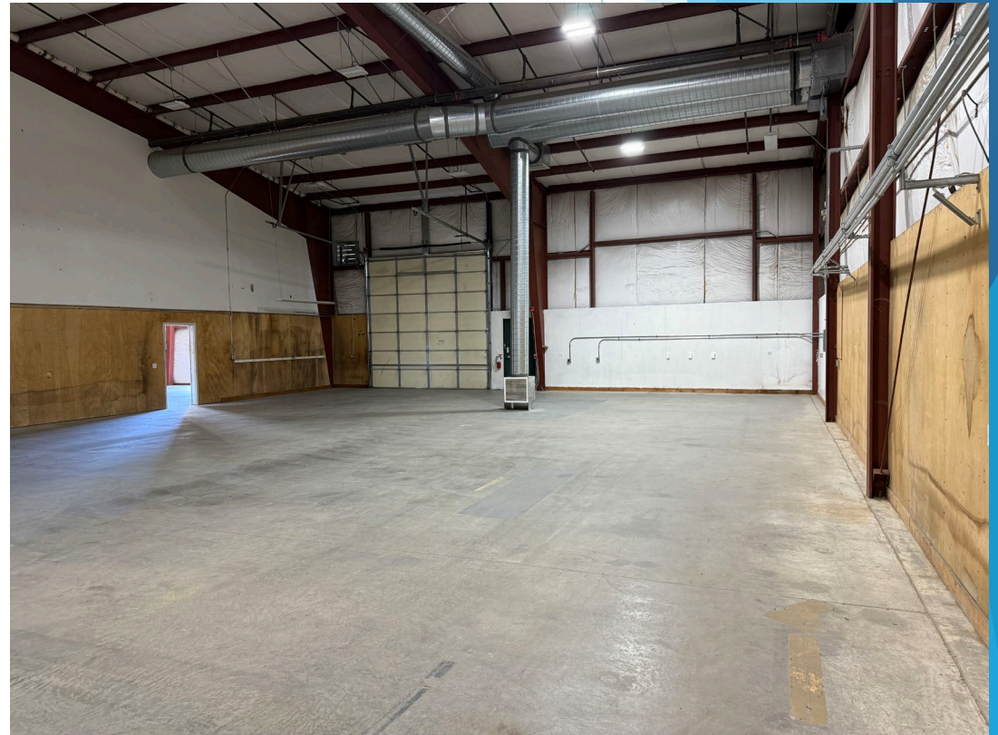
Working Bay 2