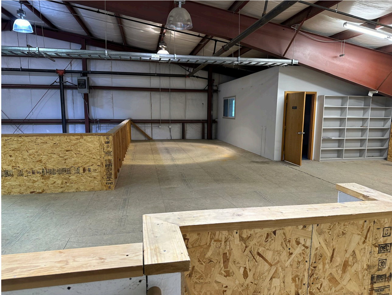
Upper Floor Storage