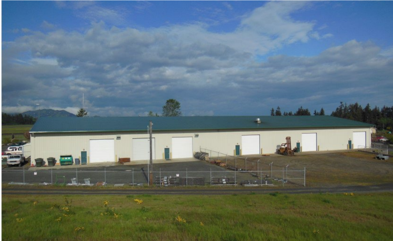
Partially Fenced Laydown Area