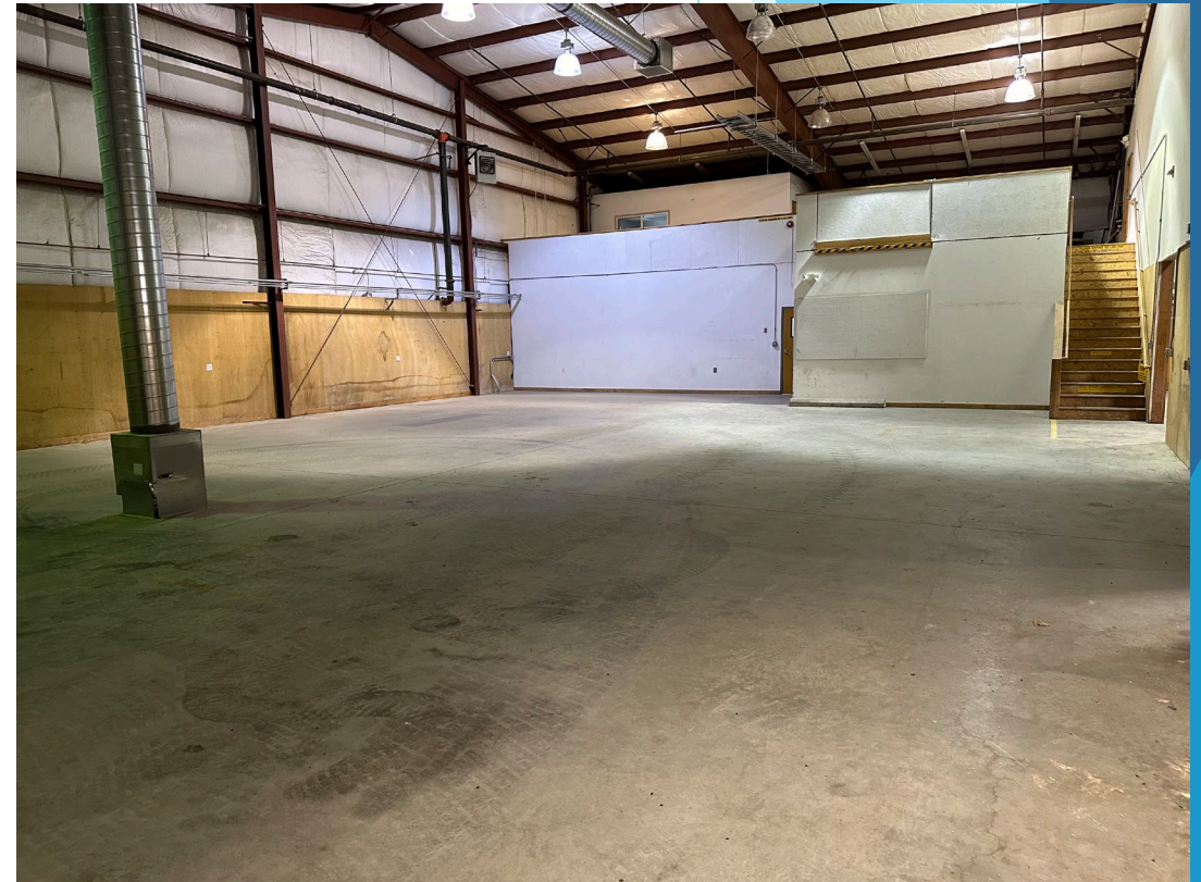
Working Bay 2